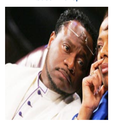
1 Cor. 6:9-11

"Know ye not that the unrighteous shall not inherit the kingdom of God? Be not deceived: neither fornicators, nor idolaters, nor adulterers, nor effeminate, nor abusers of themselves with mankind, 10 Nor thieves, nor covetous, nor drunkards, nor revilers, nor extortioners, shall inherit the kingdom of God. 11 And such were some of you: but ye are washed, but ye are sanctified, but ye are justified in the name of the Lord