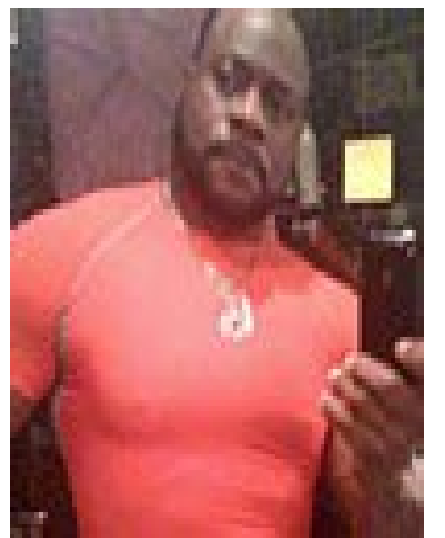
1Thess. 5:21-22 "Prove all things; hold fast that which is good. 22 Abstain from all appearance of evil." KJV

about the destroyed faith and souls of these deluded, molested children and stand and protect them, not a hardened sexual predator displaying such divergent sinful behavior.